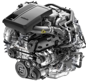
LM2 3.0L I6 Turbo