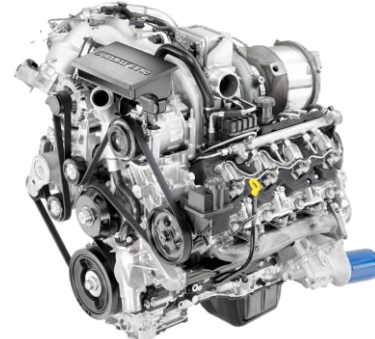
L5P 6.6L V8 Turbo