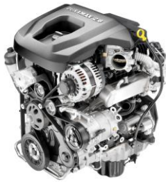
LWN 2.8L I4 Turbo

A modern legend was born in 2000, when General Motors introduced the Duramax 6.6L Turbo-Diesel engine for the 2001 Chevrolet Silverado 2500HD and GMC Sierra 2500HD trucks. Since then, the Duramax diesel family has grown to include the 1.6L I4 Turbo, the 2.8L I4 Turbo, and the 3.0L I6 Turbo for the 2019 Chevrolet Silverado and GMC Sierra 1500LD trucks.